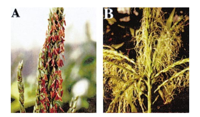
Figure 3. The silky1 Male Flower Phenotype

The transformation of stamens into pistils in silky1 mutants is reminiscent of eudicot mutants defective in